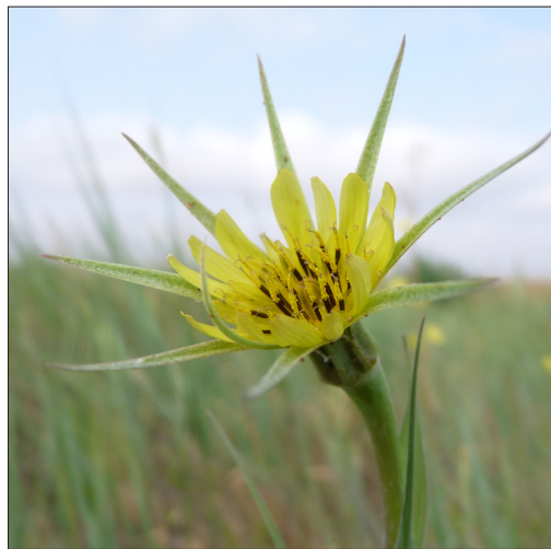
FIGURE 2. Western salsify flower.