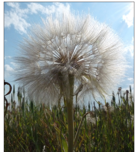
FIGURE 3. Fluffy sphere of western salsify seeds.