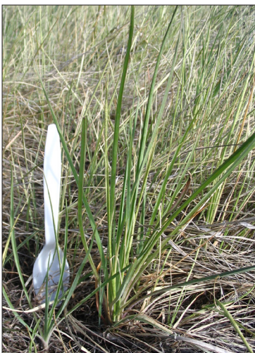
FIGURE 1. Western salsify rosette.

Western salsify has linear, grass-like leaves that clasp the stem at the base. Prior to bolting and flowering, the leaves can be readily mistaken for grass (Figure 1). However, they have a smoother and more rubbery-like feel than grass leaves, have hairs in the axils, and exude a milky juice when broken. The yellow, dandelion-like flower heads are born singly on 12 to 40 inch (30 to 100 cm) stems that are swollen and hollow below the flower head (Figure 2). Ten or more long, narrow involucral bracts extend beyond the flowers. There are 20 to 120 ligulate flowers per head. The flowerhead matures to form a three to four inch diameter fluffy sphere comprised of seeds with long, slender beaks and a white, umbrella-like pappus that aids wind dispersal (Figure 3). The fluffy sphere of seeds looks similar to that of a dandelion, only much larger. Western salsify has a thick, fleshy taproot.